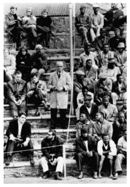
Segregated seating at a sports event

Apartheid law prohibited sexual relations and marriage between whites and non-Europeans in the "Prohibition of Mixed Marriages Act" (1949) and the "Immorality Act" (1950).